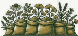
Bulk Herbal Supply

Reliable sourcing for manufacturers and brands.