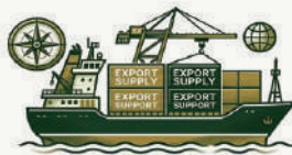
Export Supply Support