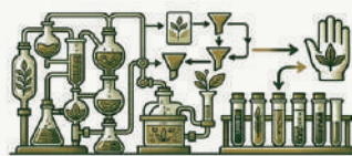
Custom Ingredient Sourcing